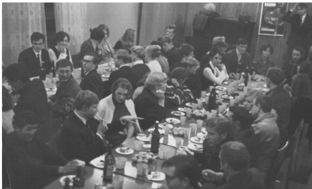
Figure 4. A photograph of a banquet held after an "Archimedes" performance.