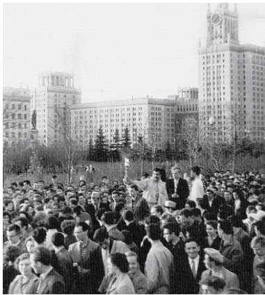
Figure 1. A photograph of the first Physicist's Day parade. Landau is in the center, wearing a black suit.

Such operas reached massive proportions with "Archimedes," which originated from a 1959 physics department Komsomol (Soviet Youth Communist League) conference. The conference resolved to prepare a fun springtime celebration for 1960, and to create a new festival, "Physicists' Day" ( Den' fizikov ), celebrated on the supposed birthday of Archimedes (May 7). Over the following months, physics students invested a great deal of time and energy into preparing the festivities. The 1960 celebration, attended by a huge crowd, began with performances of amateur arts, followed by a carnival-like parade, led by floats with students dressed up as famous physicists. The world-famous physicist N. D. Landau, the faculty patron of the celebration, joined the fun on one of the floats (Figure 1).